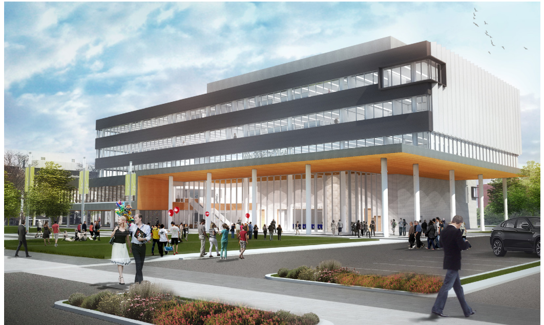
Windsor City Hall design rendering.